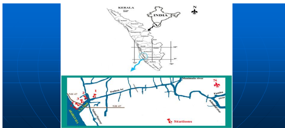
Figure-1: showing map of study site and stations selected.

Station 5 The fifth station selected was near the sand bar. The T.S. Canal gets temporarily connected to the sea by manual opening of the pozhhi during flood times in monsoon, allowing the flood waters to drain out into the sea. After the flood the sand bar is formed naturally and thus connection with sea is closed.