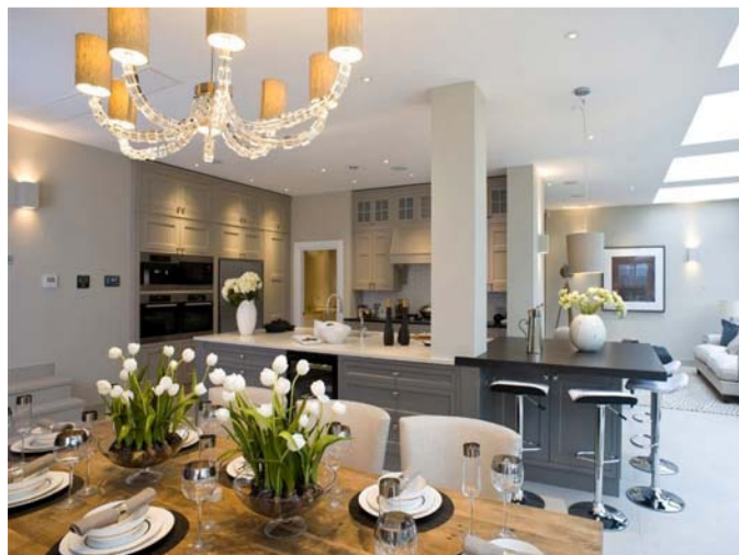
Figure-6 From your interiors to the exterior – smart home technology can transform your lifestyle 15

Awesome Ways to Take Advantage of Smart Home Technology: In our ever-changing hi-technology world it seems like everyone is turning to "smart" technology. From the phone and tablet you carry in your pocket to controlling your home's heating and air conditioning while away on vacation on a tropical beach, smart technology is everywhere. If you have been trying to figure out what smart home technology is and how you can take advantage of it – here are 10 simple ways to enjoy the innovation in your home. Whether you are looking to save energy, time, and money or you just want to become more efficient in your home's day-to-day operations, take a look at these ideas that may transform your home and lifestyle forever.