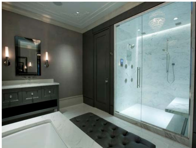
Figure-7 Control your ultimate bathing experience while still saving water 15

feeling of more water without using more water. Other faucets can turn on and off automatically by motion and the temperature of the water can be seen by a color LED light indicator before putting your hands under the water. These smart technologies ensure a better and safer user experience and less water wasted – all at once 15 .