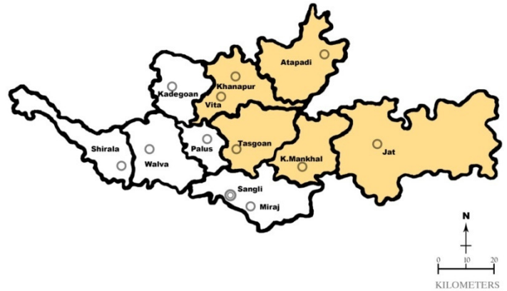
Figure-3 Map of Sangli District