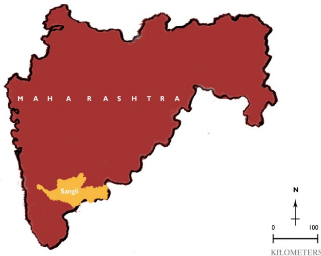
Figure-2 Map of Maharashtra showing location of Sangli district.